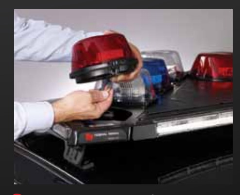
3 Unplug connection from lightbar