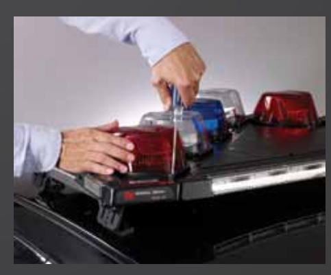
Remove a screw