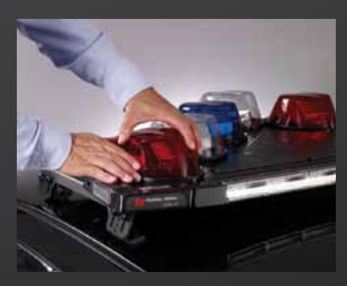
Twist the Pod to remove from base