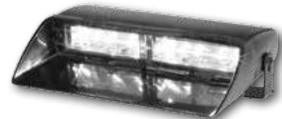
329202-RWBW in LED Takedown mode

Comparison Table: The following table compares the Viper S2 and SpectraLux Viper S2